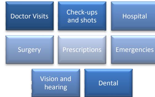
Figure 2. Florida KidCare Covered Services